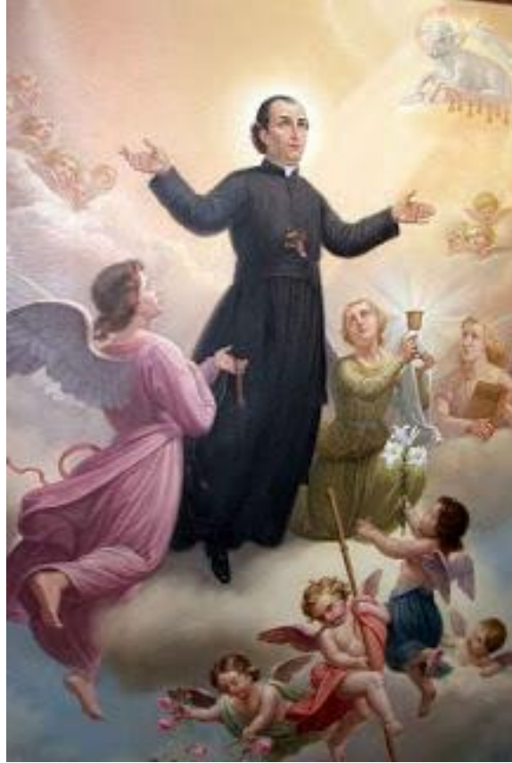
St. Gaspar del Bufalo, Pray for us!