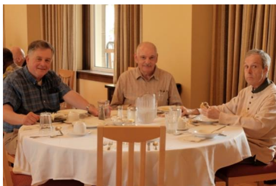
Scenes from Retreat 2018